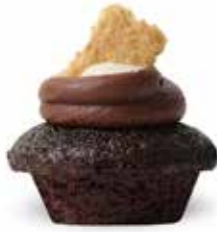
S'MORES FAN FAVORITE • MAR 4 - NOV 3

CAKE • Vanilla ICING • Vanilla TOPPING • Rainbow Sprinkles