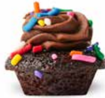
CHOCOLATE & SPRINKLES FAN FAVORITE • MAR 4 - NOV 3

CAKE • Yellow STUFFING • Dulce De Leche ICING • Chocolate TOPPING • Nut Free Blondie with Rainbow Sprinkles