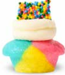
ELECTRIC TIE-DYE FAN FAVORITE • MAR 4 - NOV 3

CAKE • Chocolate STUFFING • Biscoff ICING • Cake Batter TOPPING • Brownie Piece with Pink Chocolate Drizzle