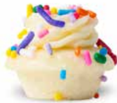
VANILLA & SPRINKLES FAN FAVORITE • MAR 4 - NOV 3

CAKE • Tie-Dye Vanilla ICING • Vanilla TOPPING • Blue, Green, Orange, Pink & Yellow Nonpareil Brittle