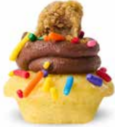
BLONDIE FAN FAVORITE • MAR 4 - NOV 3

CAKE • Yellow STUFFING • Dulce De Leche ICING • Chocolate TOPPING • Nut Free Blondie with Rainbow Sprinkles