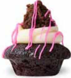
COOKIE BUTTER BROWNIE FAN FAVORITE • MAR 4 - NOV 3

CAKE • Chocolate ICING • Chocolate TOPPING • Rainbow Sprinkles