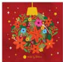
CHRISTMAS BOX HOLDS 25 & 50