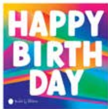
GROOVY BIRTHDAY BOX HOLDS 50