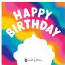
GROOVY BIRTHDAY BOX HOLDS 25