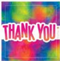
THANK YOU BOX HOLDS 25 & 50