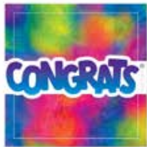
CONGRATS BOX HOLDS 25 & 50