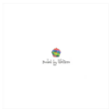
CORPORATE BOX HOLDS 25, 50, & 100