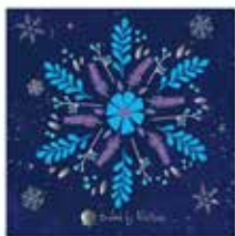
HOLIDAY BOX HOLDS 25 & 50