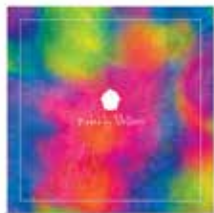
CLASSIC BOX HOLDS 25 & 50

Keep it simple or make a statement with our premium gift boxes! No matter the occasion, we've got you covered.